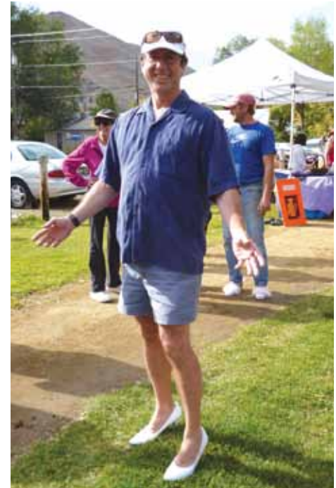
Men Speak Out to challenge beliefs that perpetuate violence.